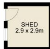
SHED 2.9 x 2.9m